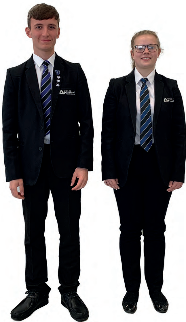
An example of compulsory Academy uniform