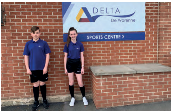
Compulsory PE Kit